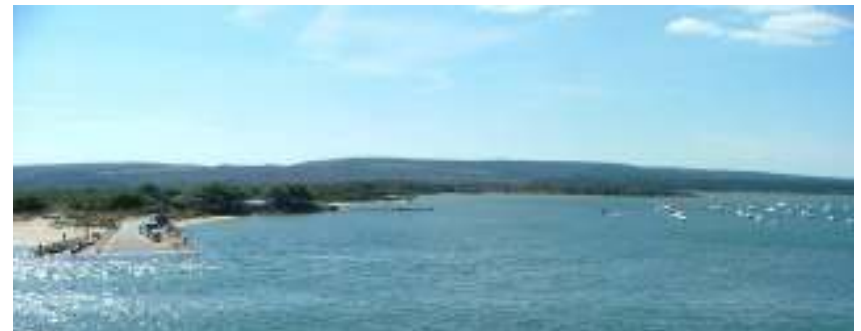
Studland Ferry and Poole Bay