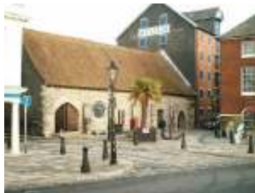
Old Poole Page 2

Maps reproduced from https://www.openstreetmap.org/